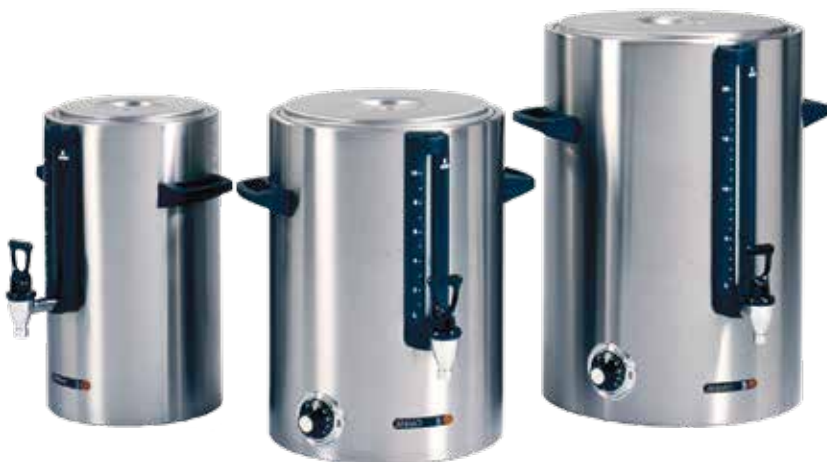
+ WKT-D - series