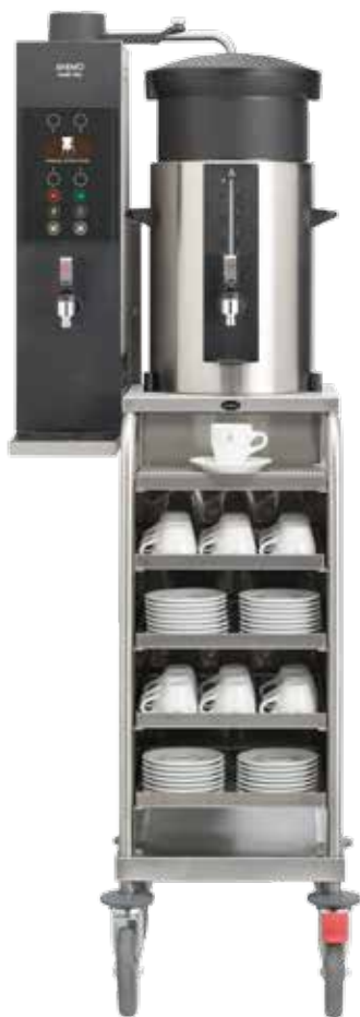
+ Type - JR (Type ST is suitable for large containers)