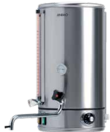
+ WKI - series