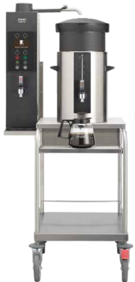
+ Type - S (Type - C is suitable for 2 containers)