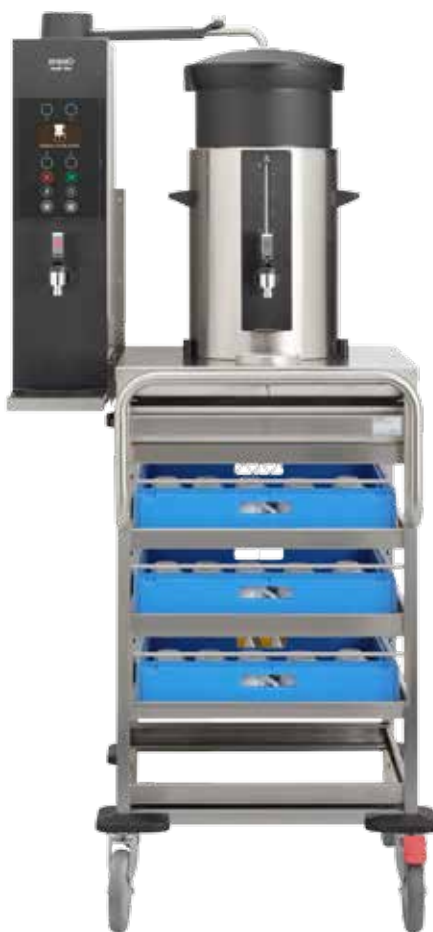
+ Type - SK 10 VL