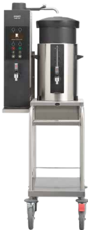
+ Type - J