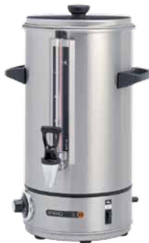
+ WKT - series