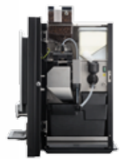
OB 2 (XL) NG