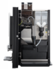
OB 3 (XL) NG