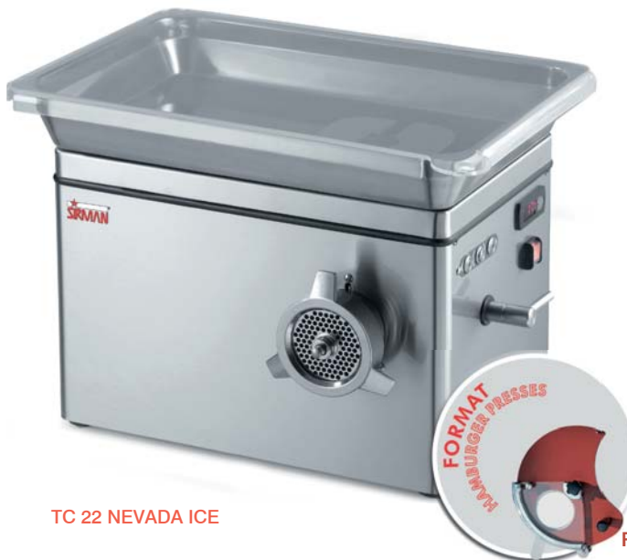
TC 22 NEVADA ICE