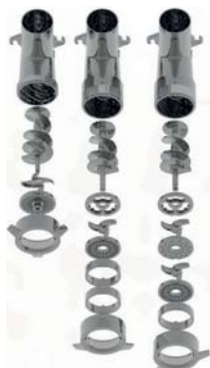
Standard o enterprise 1/2 Unger Unger Totale