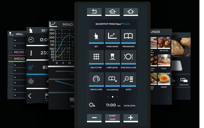
MASTER.Touch PLUS Interface

With the PLUS version you have all the technological power of MIND.Maps™ in an interface that has even more space. A creative experience without limits that you cannot wait to repeat.