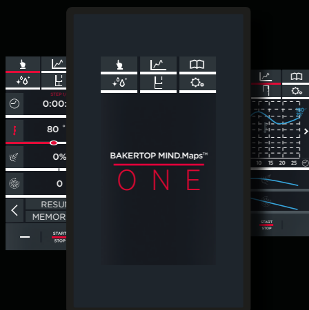
MASTER.Touch ONE Interface

When the most advanced technology becomes clear you can concentrate on your work right from the very first day.