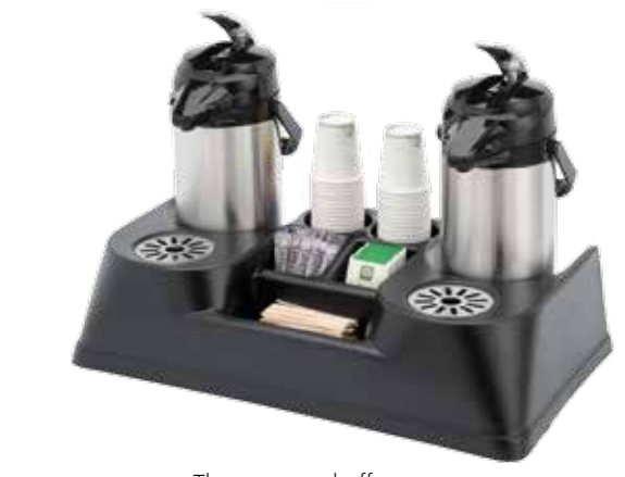
Thermos jug buffet

Perfect for cleaning thermos jugs and places that are difficult to reach.